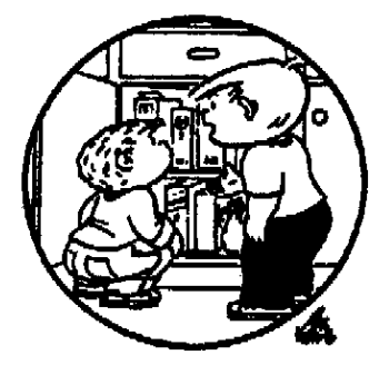
"Conscience is like Mommy tellin' you not to do somethin', but she isn't there."