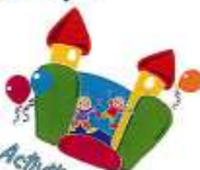
Activities for kids bounce house, face painting and games