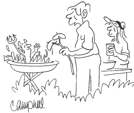
"I'M BEGINNING TO FEEL PRETTY BAD ABOUT SKIPPING CHURCH FOR A PICNIC."